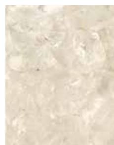
Diamond Crystal Media (included)