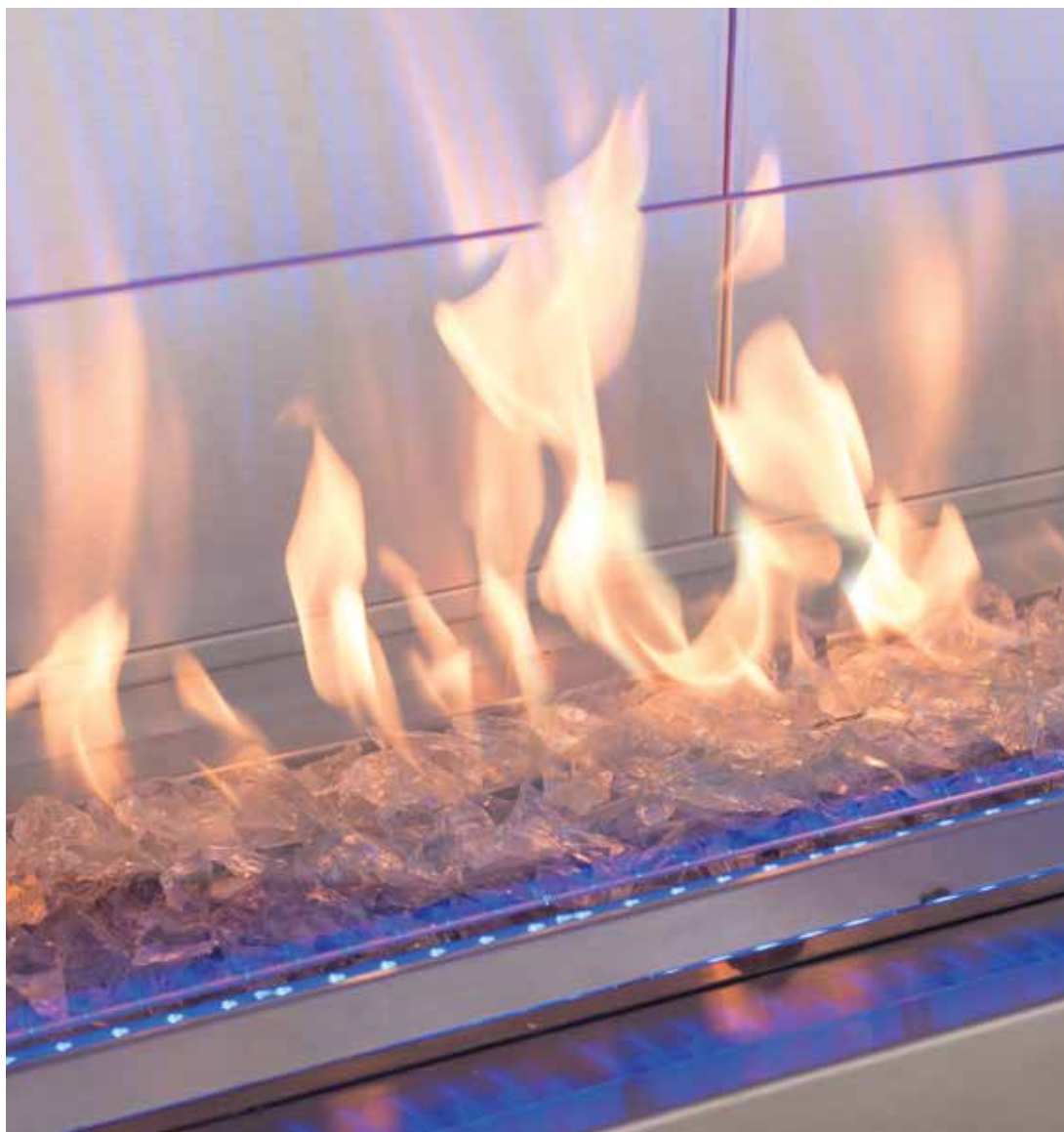
Barcelona Lights fireplace shown with Diamond Crystal large crushed glass media (included) and customizable LED lighting.