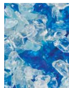
Sapphire Blue Media