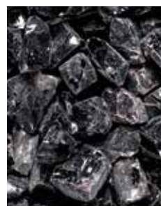
Onyx Black Media